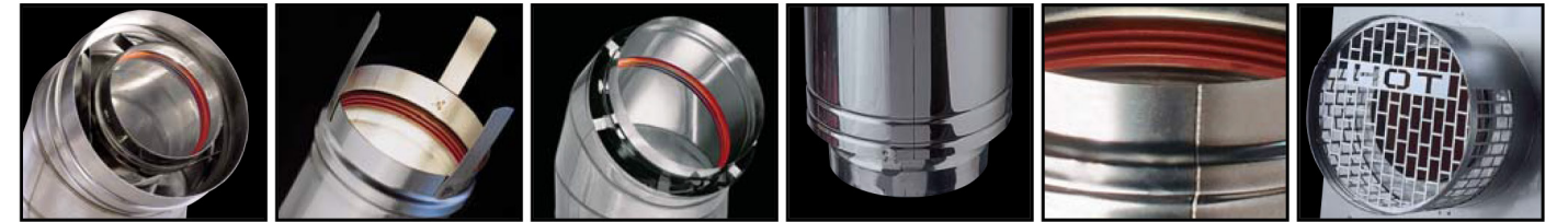
All Saf-T Vent systems are UL/cUL tested and listed.

To determine the right Saf-T Vent model for your application, please consult with the Heatfab sales and engineering team – industry experts that can provide application engineering and technical support for complete system layouts, including special product applications requiring complex routing and unique manifold system design.